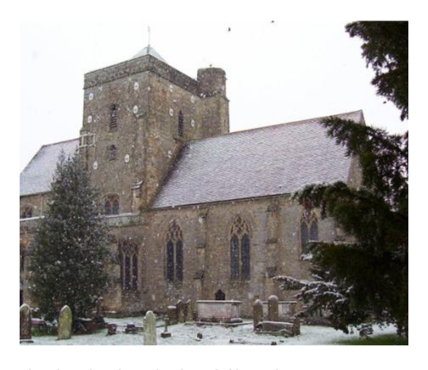
ECHYNGHAM CHURCH , ETCHINGHAM, SUSSEX, ENGLAND original about \; 1360

Researched by Charlotte Carpenter Smith 2011 Etchingham church Sussex, England 1300